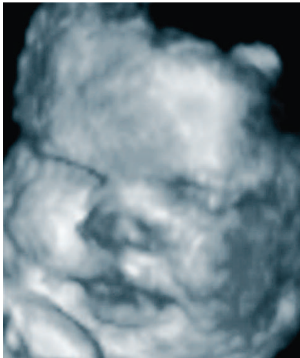
3-D ultrasound produces crisp, highly detailed images, as this baby's face shows.

South County Hospital is pleased to offer the newest advance in ultrasound imaging technology – the Logiq 9 from GE – producing crisp, highly detailed, three-dimensional images not possible before the advent of this new, sophisticated equipment.